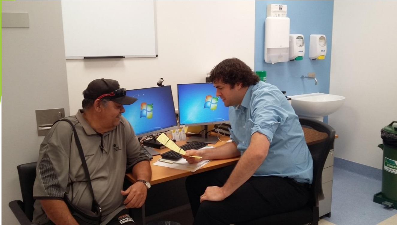
Visit to my GP