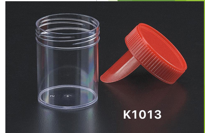
Sent x 3 Vials For Testing