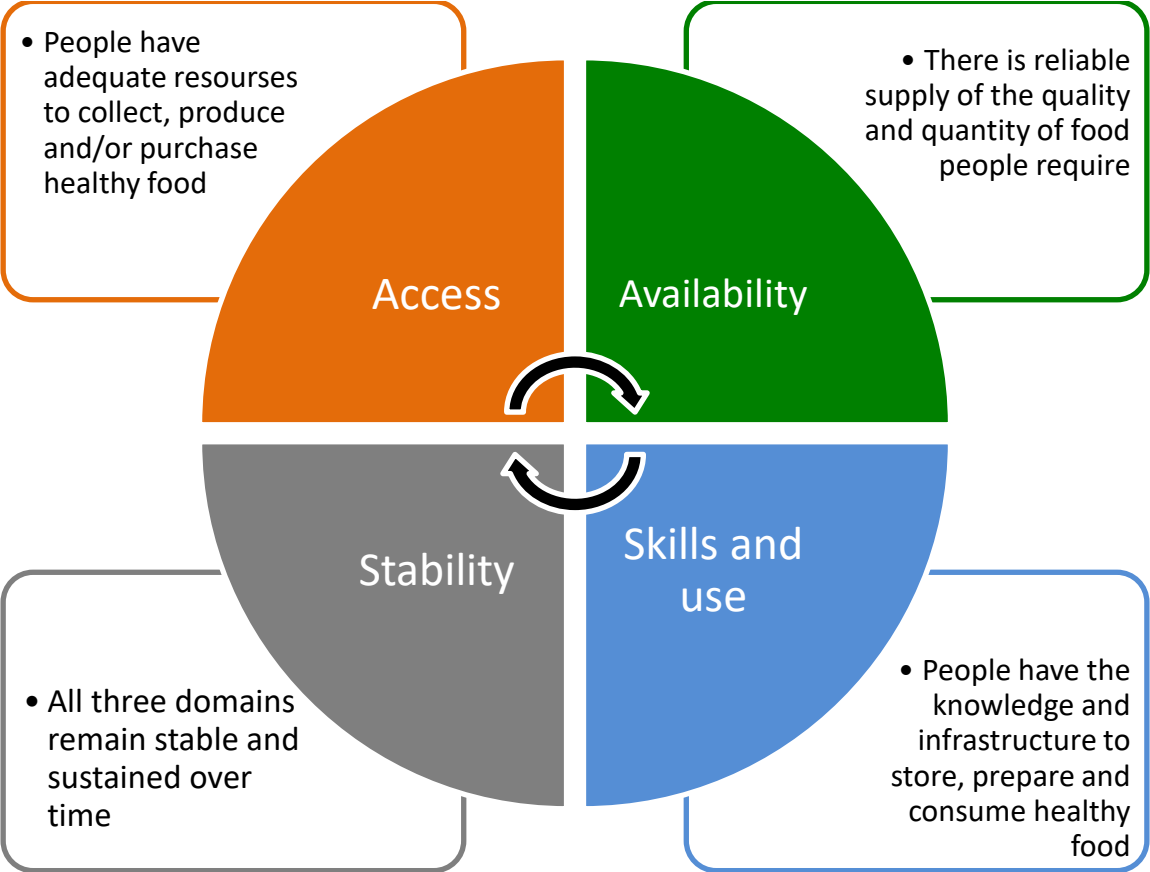
Figure 1. Domains influencing food security in communities and households

compared to 2% nationally. Childhood anaemia can lead to developmental vulnerabilities, falling below the 10 th percentile in one or more developmental domains 16 . The interconnection to high rates of food insecurity with lifelong effects, including poorer education outcomes, unemployment as well as impacts on overall wellbeing, is significant and plays a role in the life expectancy gap between Aboriginal and Torres Strait Islander people and the rest of the nation 8,9 .